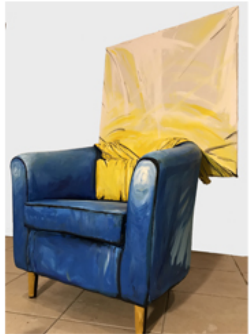
Side view of armchair