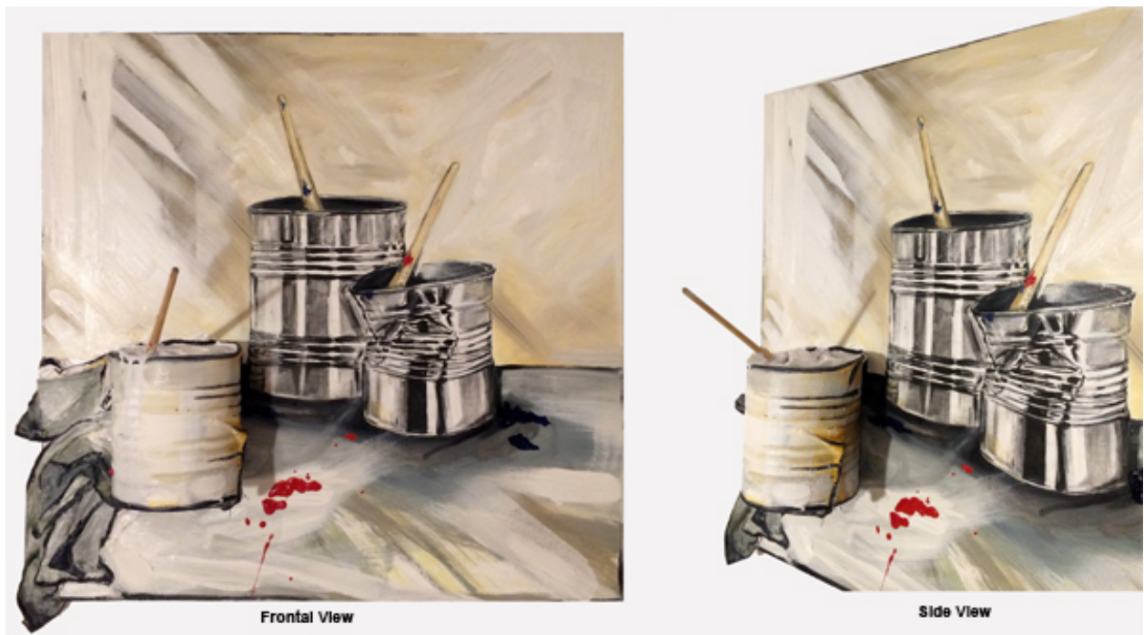
"Yes We Can" Oil, Acrylic and Pencil on Canvas, 30" x 31.5" x 8"

Taking advantage of the front and back of the artist's canvas frame, I use the canvas itself as both a surface and an object by sculpting or extending the canvas cloth beyond the frame of the painting. I combine linear drawing and three-dimensional objects on, beneath or behind the canvas melding them into the painting. I use texture, paints, strong contours and color to emphasize the painting and transitions into relief and onto objects.