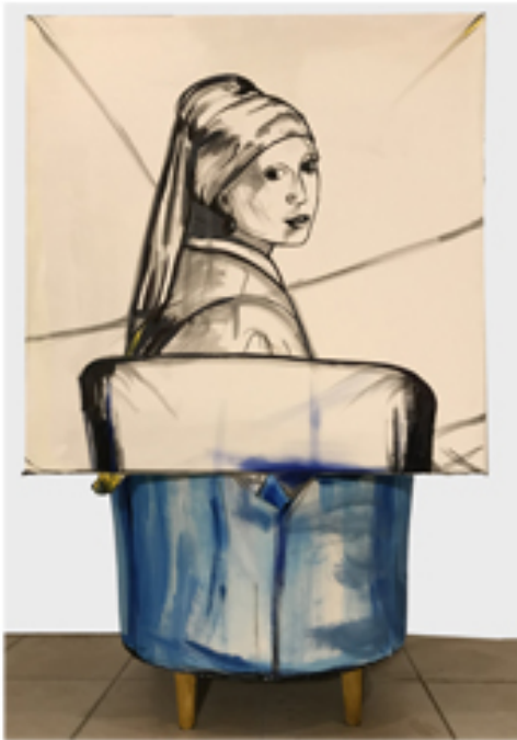
Back view of armchair