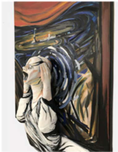
Detail Left Side View

“SCREAM FOR US” Mixed Media on Canvas, 36” x 56” x 9”