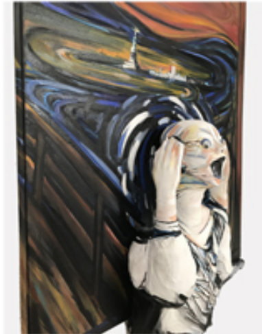
Detail Right Side View