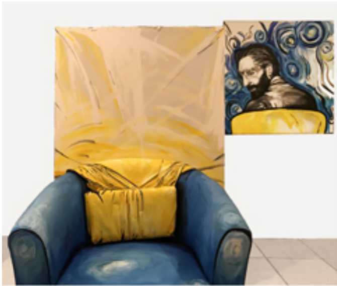
Frontal view of OFF THE WALL: MUSICAL CHAIR with accompanying painting behind it.