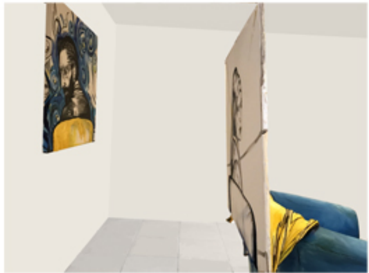
Side view of the installation

"Off the Wall: Musical Chair" Oil and Acrylic on Canvas, Armchair 59" x 36" x 27.5", Painting on Wall 30" x 30"