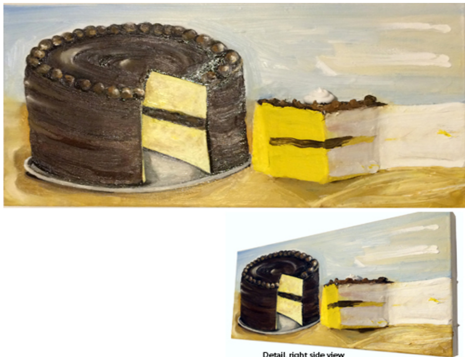
"Piece of Cake" Mixed Media on Canvas, 24" x 12" x 3"

Taking advantage of the front and back of the artist's canvas frame, I use the canvas itself as both a surface and an object by sculpting or extending the canvas cloth beyond the frame of the painting. I combine linear drawing and three-dimensional objects on, beneath or behind the canvas melding them into the painting. I use texture, paints, strong contours and color to emphasize the painting and transitions into relief and onto objects.