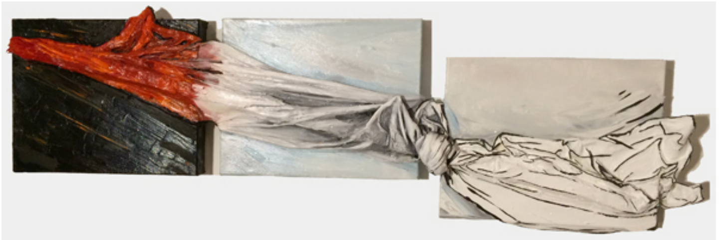
"To Infinity and Beyond" Mixed Media on Canvas, 47" x 13.5" x 4"

From the flat surface it can be or become revealed, illustrated, transported, incarnated, materialized, objectified, a simile, a reproduction or a relief painting. Retaining the painterly characteristics of its former self, it can be experienced in our environment and in our space as a realized painting.